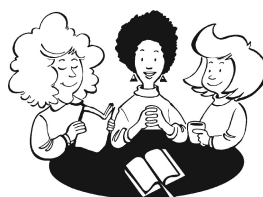
Tuesday Ladies Bible Class

Please bring a verse/s where Christ quotes the old testament to our next class on Tuesday, January 30 th . The ladies will have lunch at Paula Foster's home after class.