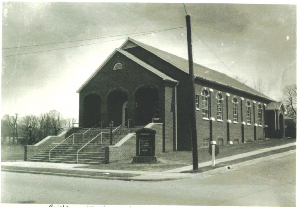
Building First Used For Worship 93-1950