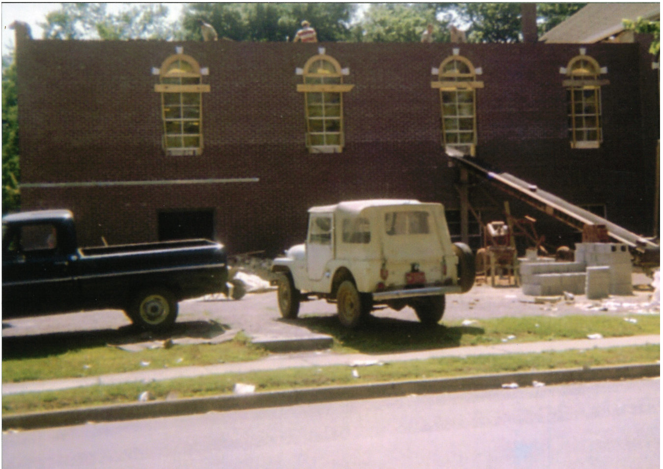
In the former location of the preacher's house, an annex was added. The annex was completed in September, 1968.