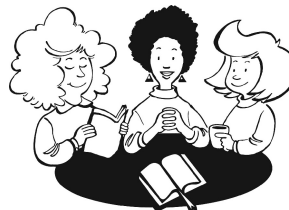
Tuesday Ladies Bible Class

Wed. Bible Study..... 102 Sunday Bible Study..... 117 Sun. A.M. Worship..... 251 Sun. Night Worship..... 94 Contribution..... $5425.31 Budget..... $7556.00